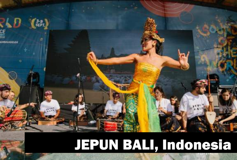
JEPUN BALI, Indonesia