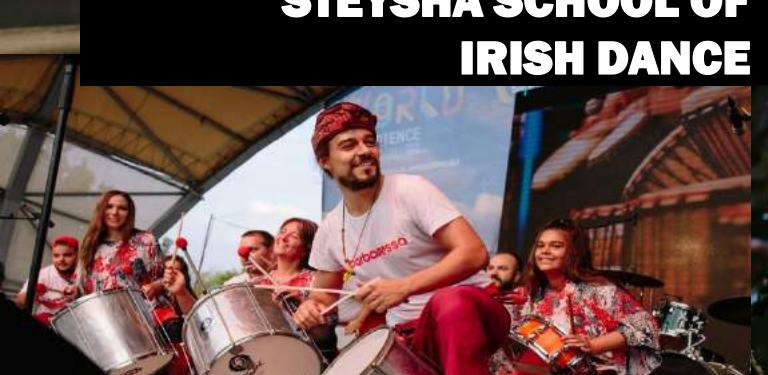
BARBAROSSA SAMBA GROUP, Brazil