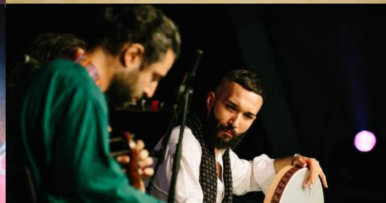
ALFA RUBIOS, Turkey