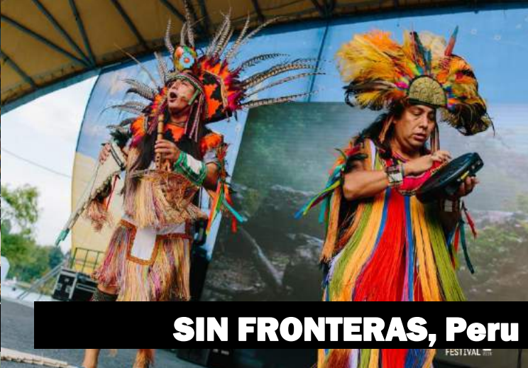
SIN FRONTERAS, Peru