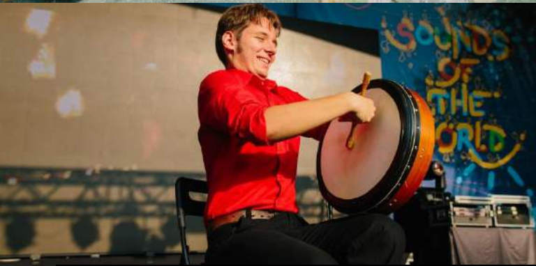
STEYSHA SCHOOL OF IRISH DANCE