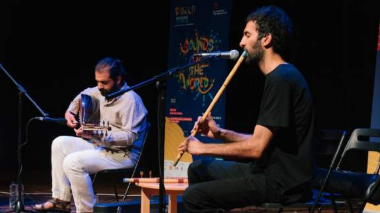
ROOTS REVIVAL, Iran & Syria